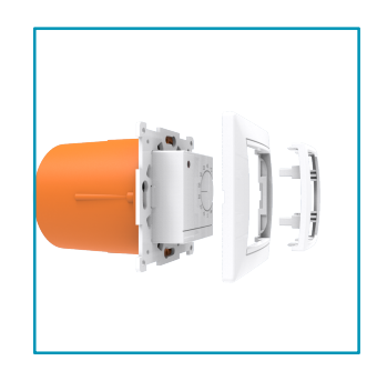
Schneider Unica frame Schneider Exxact frame Legrand Valena frame